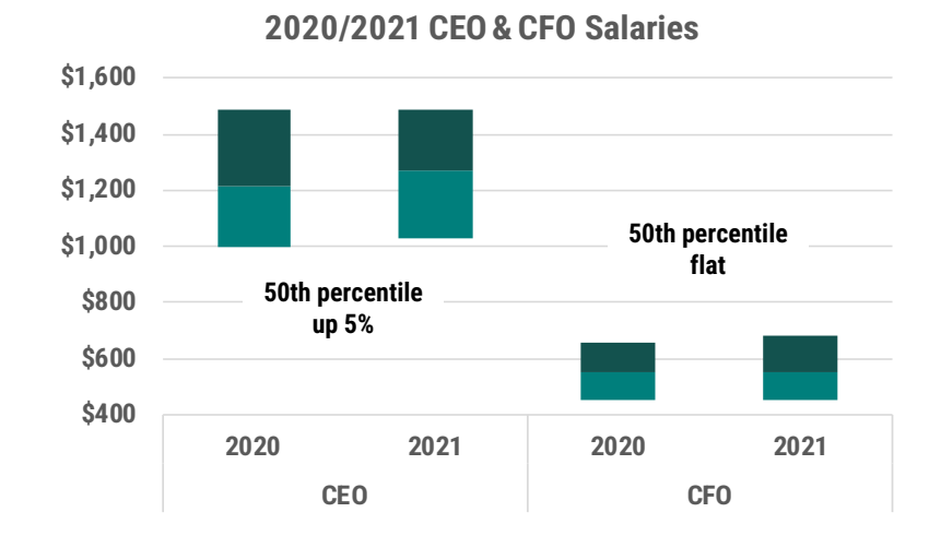
Chart 1: 2020 and 2021 Salaries

The following compensation trends are based on the same incumbent in both 2020 and 2021 and represent actual compensation disclosed for 2020 and 2021, including salaries, actual bonuses and grant values of long-term incentives (all reported in CAD). As illustrated in Chart 1 , salaries were relatively flat between 2020 and 2021 with limited year-over-year changes made (some of the change was the result of pandemic-related reductions rolling off in 2021).